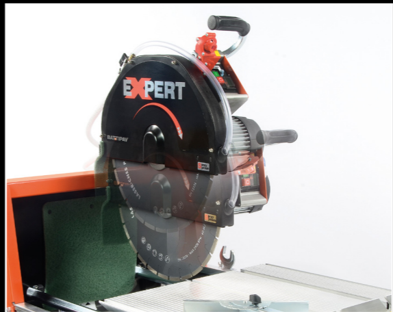
The cutting head is tilting and can be locked at the intended height.