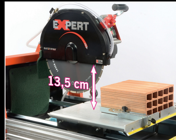
The cutting position with sliding carriage.