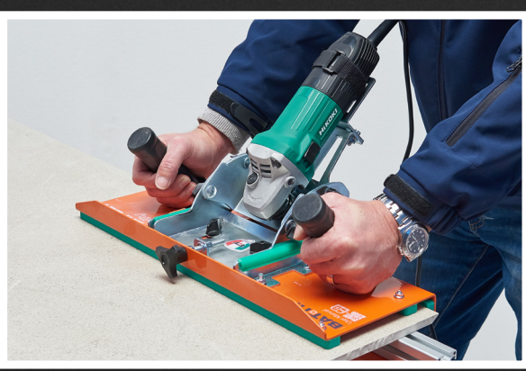
Strong structure, precise and fluid sliding with polyethylene pads, practical and comfortable handles on which to apply the pressure necessary for advancement.